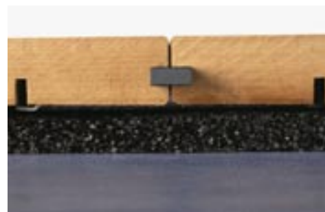
Plastic loose tongues guarantee a stable, safe and even floor surface.