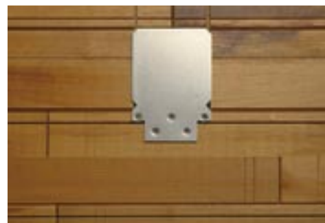
The unique fitting that holds the panels locked together - on the back of the boards.

The construction height of a Junckers portable sports floor system is either 27 or 32 mm depending on underlay used.